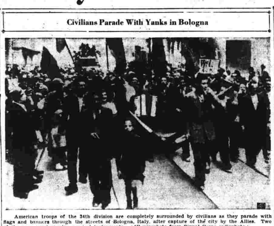
Civilians Parade With Yanks in Bologna

JARVIS REALTY CO. BUILD WITH JARVIS FOR SECURITY!